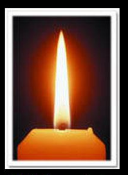
Shukr Noor-e-Karim

"You will benefit of you obey the Firmans of the Imam of the time. I have come here for your upliftment and salvation of your souls. As the captain and the crew who steer the ship in the ocean are aware of the direction and whereabouts of stones, hillocks, sand and also know where the water is deep, where the passage is clear and which way they can reach the destination safely, in the same way Imam knows all about the path which leads one to salvation." — Imam NOOR Mowlana Sultan Muhammad Shah (a. s.) Precious Pearls No. 5 (Zanzibar 30-9-1899)