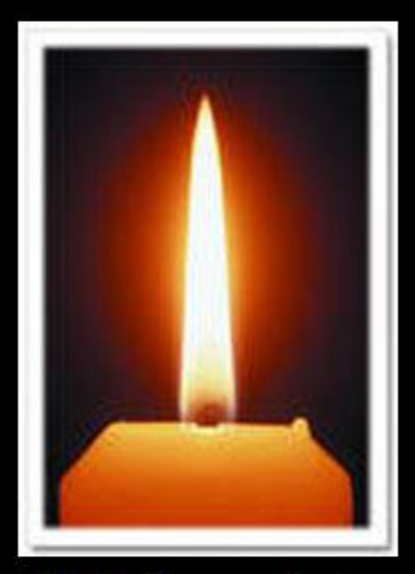
Shukr Noor-e-Karim

— Imam NOOR Mowlana Shah Mustansir bi'l-laah II (a.s.) Pir Pandiyat-i Jawanmardi (p.61)