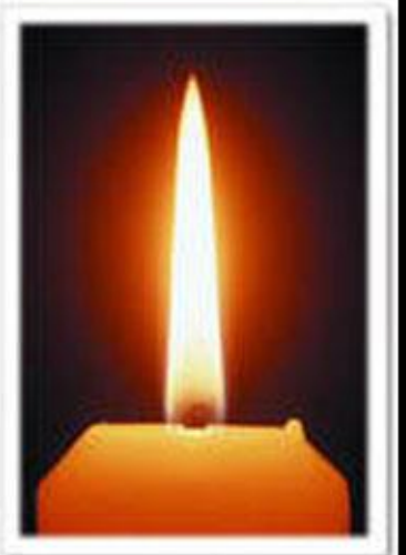
Shukr Noor-e-Karim